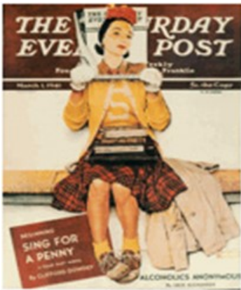
Cover of The Saturday Evening Post , March 1, 1941

The offices of The Saturday Evening Post also received a large number of inquiries. A March 26, 1941, bulletin by the Post relays the power behind the article.